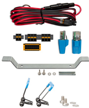
Accessories included with the Ekrano GX