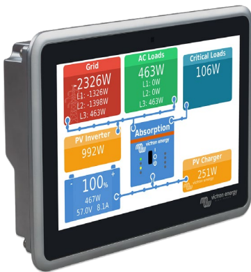
Ekrano GX front and back