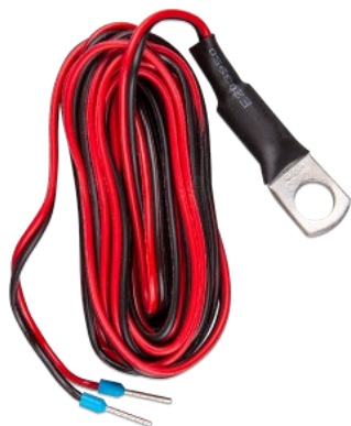
Temperature sensor for Quattro, MultiPlus and GX device (e.g. Ekrano GX) as an additional accessory.